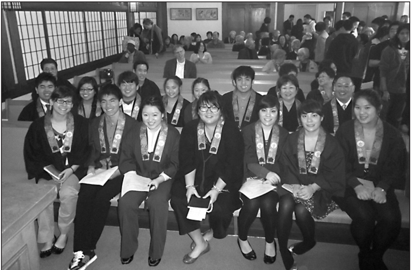
Youth Minister Assistants