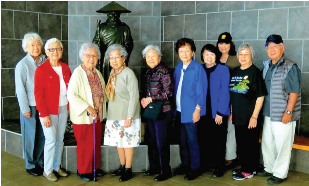
Momiji Kai during their trip to Jodo Shinshu Center and J-Sei Headquarters in September

AT OUR LAST GATHERING WE were fortunate to be able to see the movie, "Sugihara: Conspiracy of Kindness" , which I believe many of you have heard about and seen. It centers around a gentleman, Chiune Sugihara , a diplomat of Japanese descent at the Consulate in Kaunas, Lithuania, pre-world War II in 1939. It seems Mr. Sugihara's compassion took over and against orders from Japan he had issued over 6,000 visas to the Jewish refugees seeking help enabling