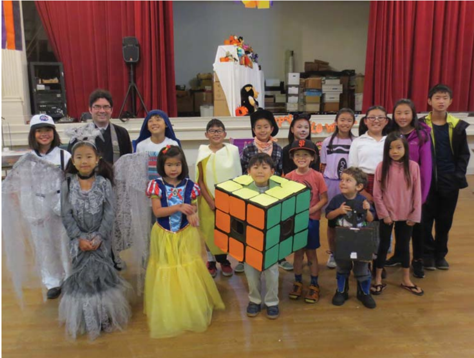
Dharma School Halloween 2016.

THANK YOU TO OUR WONDERFUL Keirokai members! The Dharma School students painted dish towels in their own designs, packaged them, and presented them to the Keiro members on October 9. We even practiced how to present them to each of our Keiro members! We hope you like them. They were made with love, just for you.